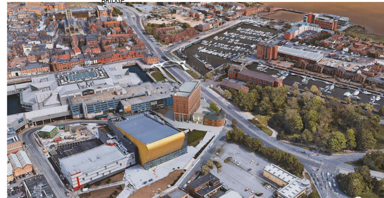
AERIAL VIEW OF PROPOSAL IN THE CONTEXT OF HULL BONUS ARENA, HULL MARINA, HULL MINSTER, THE OLD TOWN AND PROPOSED NEW BRIDGE