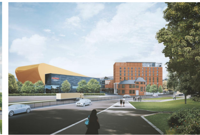
APPROACH FROM A63 WEST