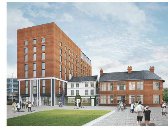
VIEW OF PROPOSED BUILDINGS AND PUBLIC REALM