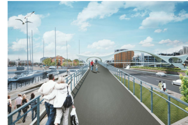
APPROACH FROM HULL MARINA AND PROPOSED NEW PEDESTRIAN BRIDGE